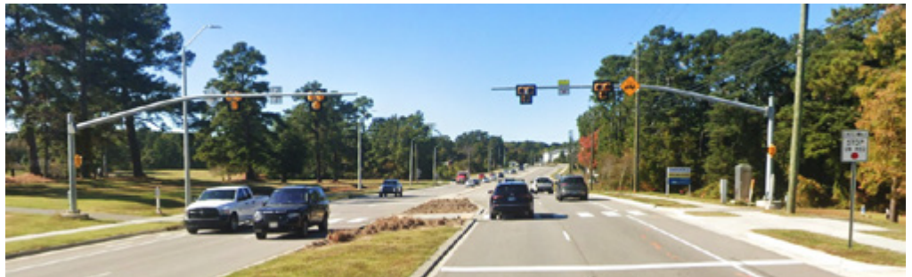
Signals similar to the ones shown above will soon be activated at Holly Springs Road crosswalks nearest the Holly Ridge Elementary and Middle schools.

Athy added that, as road widening work continues next year on the section of Holly Springs Road between Main Street and Flint Point Lane, the Town is pursuing grant funding for a similar signal near Holly Springs Elementary.